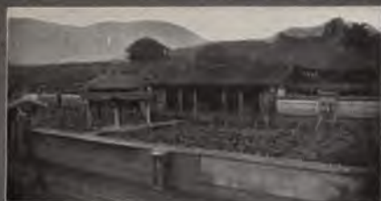
A CONFUCIAN TEMPLE